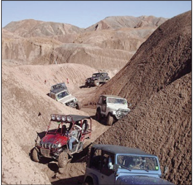
Ocotillo Wells hosting the annual Truckhaven Challenge

People, resources, interpretation, and world-class recreation—millions of people coming to enjoy the outdoors, getting some exercise, learning about the park, and spending time with family and friends. Isn't that value? In my opinion, Ocotillo Wells SVRA is over 85,000 acres of value, has something for everyone, and is a place where we can teach future leaders about real value—and about what they must do to ensure that the value of parks continues into the future.