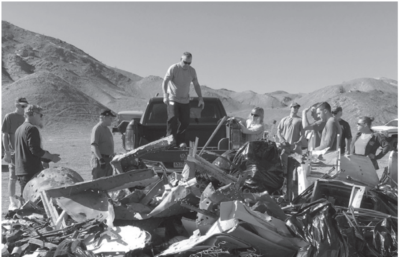
SDORC and a second amendment group, SDMust, held a joint desert cleanup at an area called Painted Gorge last Saturday.

Please make checks payable to CORVA (Donations are not deductible as charitable contributions)