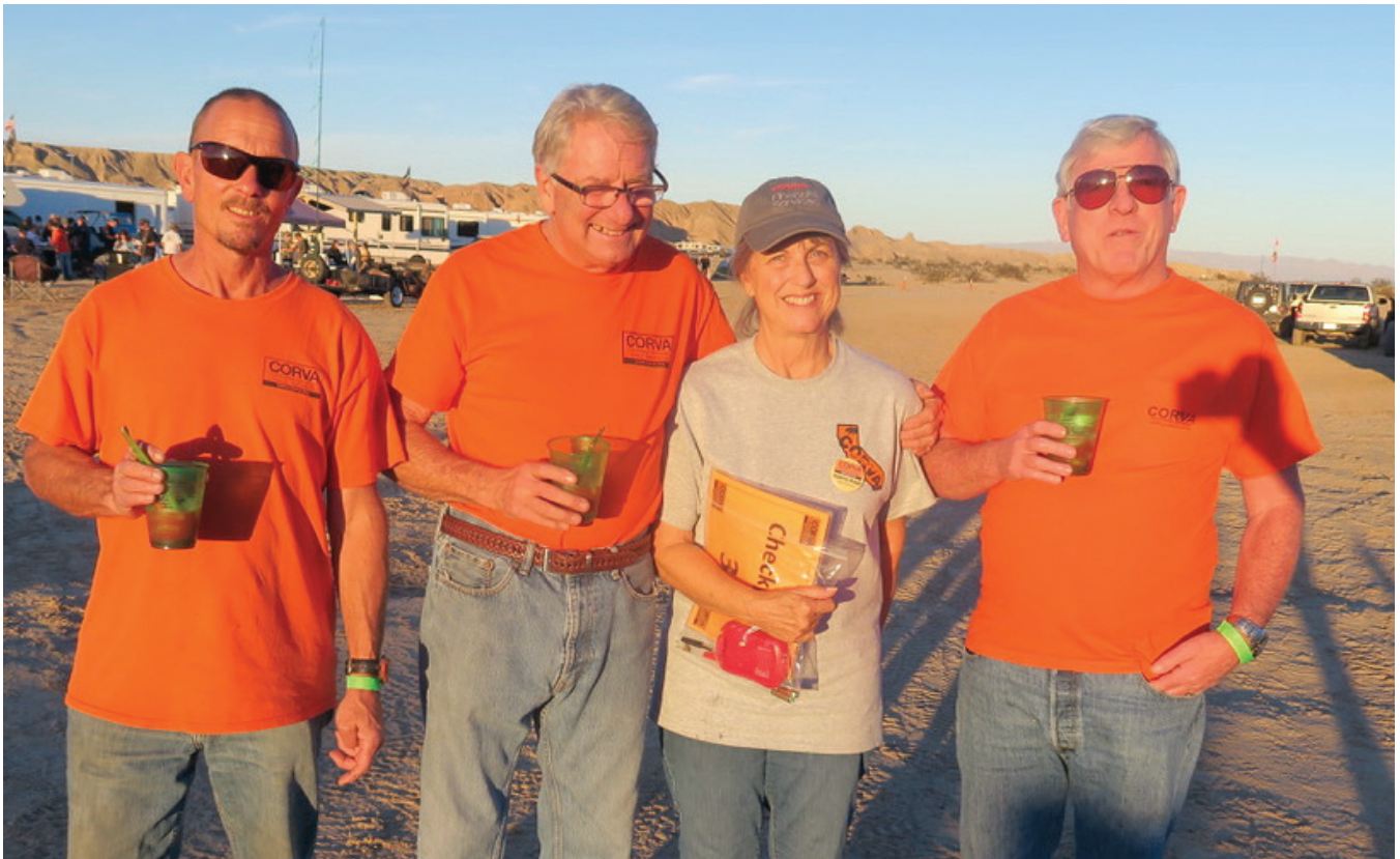
A few of the CORVA board members/volunteers at 2019 Truckhaven Challenge